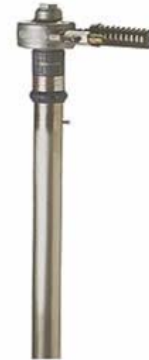
TMS-AS-40 DRUM MIXER